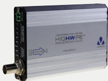
HIGHWIRE POWERSTAR DUO is also available with 2-port POE switch